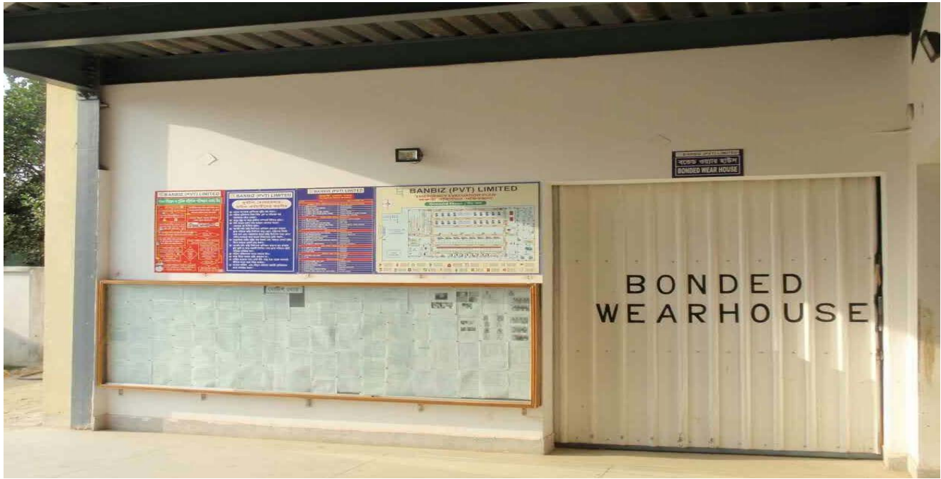
RAW MATERIAL WAREHOUSE AREA 2000 SFT TAX FREE IMPORT FACILITY