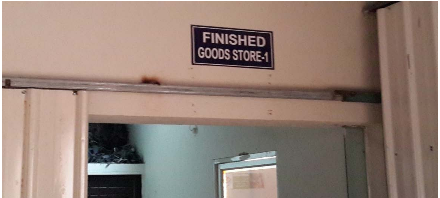
FINISHED GOODS WAREHOUSE AREA 4000 SFT GSP FACILITY FOR EXPORT